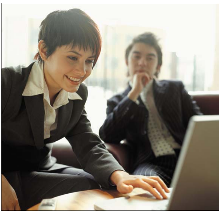
builder will ask is: